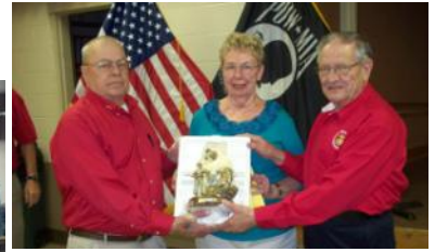
Spc Achievement Award - Wallaces