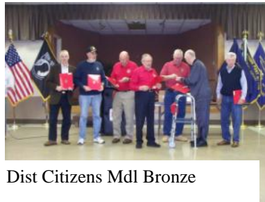
Dist Citizens Mdl Bronze