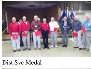
Dist Svc Medal