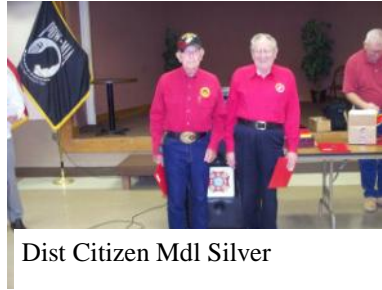
Dist Citizen Mdl Silver