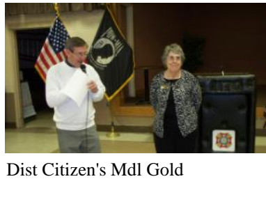
Dist Citizen's Mdl Gold